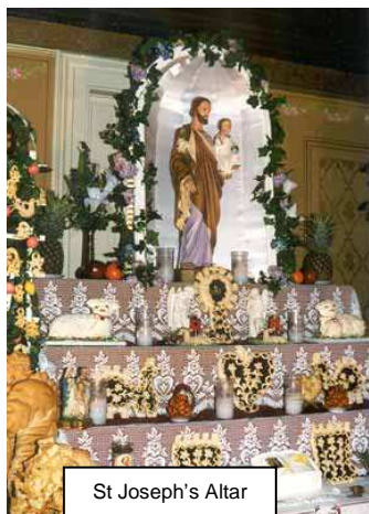
St Joseph's Altar

St. Joseph's Day is a big feast for Italians because in the Middle Ages, God, through St. Joseph's intercessions, saved the Sicilians from a very serious drought. So in his honor, the custom is for all to wear red, in the same way that green is worn on St. Patrick's Day.